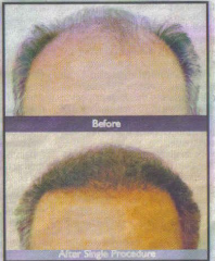
(Pic top) The biggest misconception about hair transplant is that it provides an unnatural appearance.